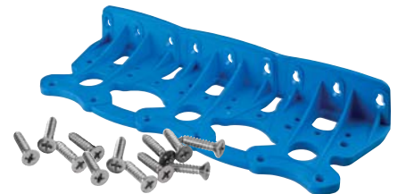
-TRIO- wall bracket* CODE RB7400019