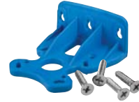
-S- wall bracket* CODE RB7400007