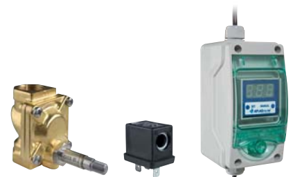
-KIT AUTO- for S models CODE RE7120024 automatic discharge kit (see pages 186-187)

In compliance with the European Standard UNI EN 1717/2002: designed to prevent back-flow contamination by making all elements downstream the discharge vent to atmosphere (protection unit symbol: DC)