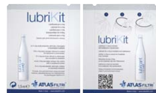
-LUBRIKIT- single-dose lubricant for housing o-ring CODE RE9020650