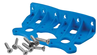
-DUO- wall bracket* CODE RB7400017