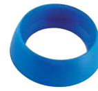
DP-base* (only for DP 10 models) CODE LB7402014

* white colour provided with housings BW (white)