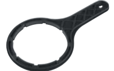
-X- spanner* CODE RB7403017